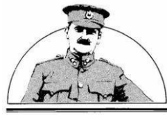
Colonel Stephens Society